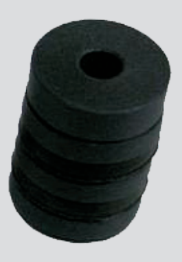
Fluorosilicone is resistant to solvents, harsh aromatics and fuels. Temperature range: -60°C to 230°C